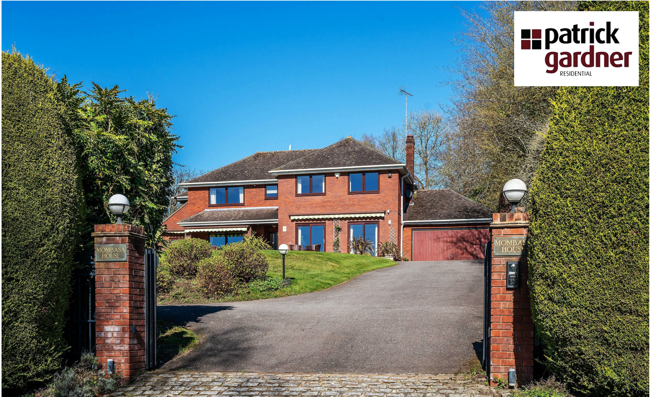
Mombasa House, The Downs, Givons Grove, Leatherhead, Surrey, KT22 8LF